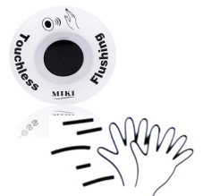
wave on sensor flush