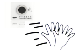
wave on sensor flus