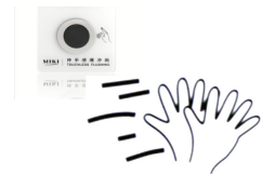
wave on sensor flush